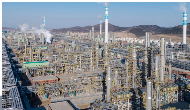
A real greenfield project: Hengli Petrochemical needed less than two years to build the gigantic refinery complex.